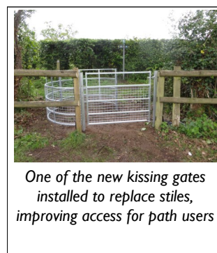
One of the new kissing gates installed to replace stiles, improving access for path users