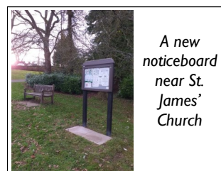
A new noticeboard near St. James' Church