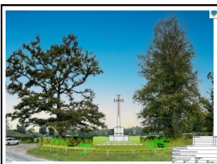
A visualisation of the War Memorial in its new home in The Village

The relocation is progressing and the 2022 Remembrance Day parade and service will be held at the Memorial Park with the Memorial in its new setting.