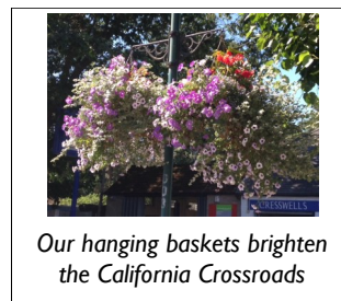
Our hanging baskets brighten the California Crossroads