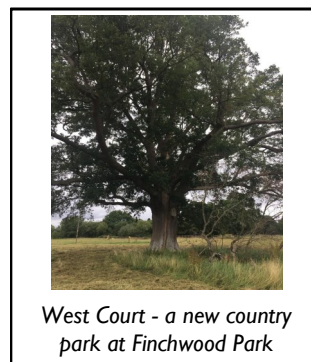
West Court - a new country park at Finchwood Park

Parish but there are around 300 homes in Finchampstead. At Finchwood Park, in our Parish, 140 homes are now occupied. When complete there will be up to 1500 homes, a primary school and community facilities.