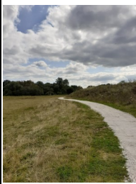
A well used route to school for local young people