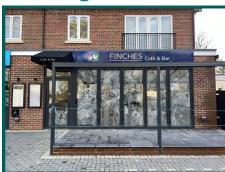
...a friendly neighbourhood café & bar