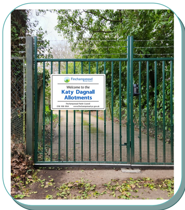
New allotment gates and signage