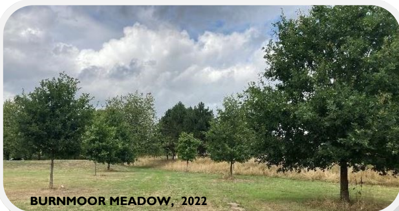
BURNMOOR MEADOW, 2022