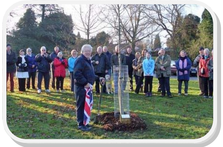
FINCHAMPSTEAD CHURCH GREEN Dec 2012

The report concludes that the survival rate of the trees is very encouraging, all the trees are growing well and in safe, suitable sites where they will be able to grow to their full glory as the years pass.