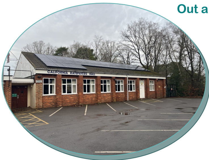
California Ratepayers Hall with its new solar panels