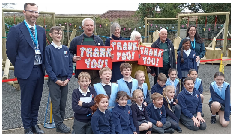
Nine Mile Ride School, KS2 outdoor play area

The FPC grants to these two schools follow a similar grant given to Finchampstead Primary School in 2023.